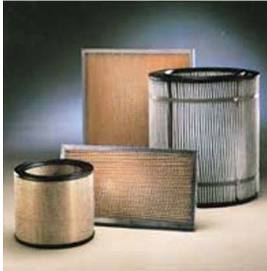
Photo Caption - Cartridge filters offer large surface area for filtration within a limited space.

Telephone: (800) 367-3591 Fax (813) 991-9700 E-mail: info@americanfabricfilter.com