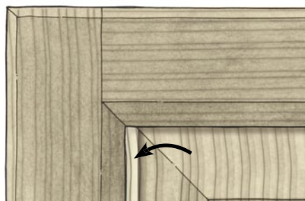
PANEL HAS SHRUNK AND EXPOSED UNFINISHED WOOD BY DOOR STILES.