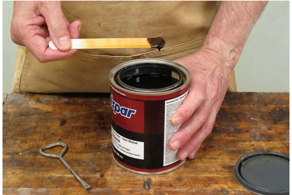
Pigment. Pigment settles to the bottom of the can and has to be stirred into suspension before use. Because the pigment particles are solid, they require a binder (some type of finish) to glue them to the wood.

Why stain? One of the principal reasons to stain wood, especially lighter woods such as this birch plywood, is to make them resemble more desirable darker woods, in this case walnut.