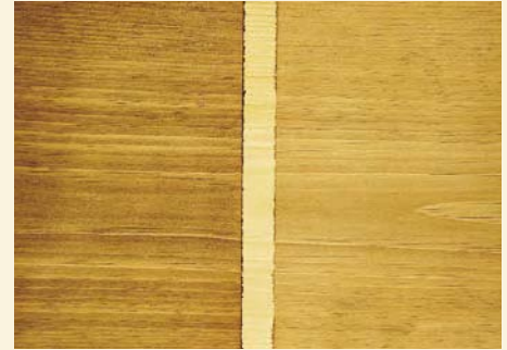
The color intensity of a stain is determined by the ratio of colorant to liquid. A full-strength commercial oil stain darkens wood more (left) than the same stain thinned 50 percent with mineral spirits (right).

Sometimes you hear that you can make wood darker by leaving a stain on the surface longer before wiping off the excess. The explanation given is that the stain penetrates deeper. This is not true. What happens is that more thinner evaporates increasing the ratio of colorant to liquid. —BF