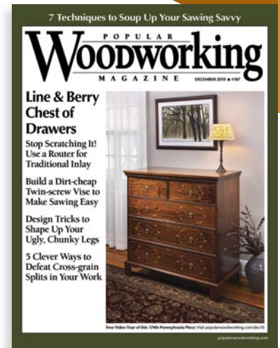
Popular Woodworking Magazine, December 2010

Your free download is an excerpt from the June 2006 , August 2009 and December 2010 issues of Popular Woodworking Magazine and is just a sample of the great finishing instruction you can find in the ShopWoodworking.com store. Buy more projects today, and continue building your knowledge!