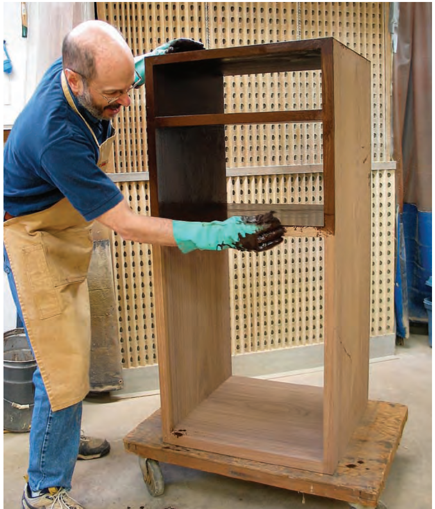
Wiping on. The most efficient method of applying stain is to wipe it on using a soaking-wet cloth. Notice on this stereo cabinet, which was made without a back, I'm not having any problem getting the stain into the inside corners.

If you're brushing one of the fast drying stains, not only might you cause blotching