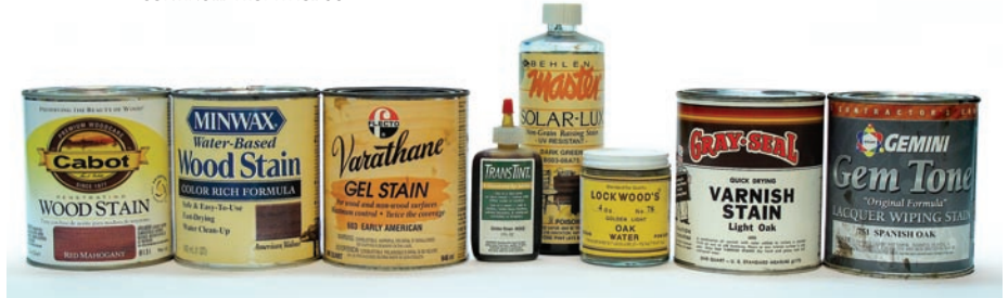
Types of stain. There are six common types of stain. From left to right are examples of oil stain, water-based stain, gel stain, two types of dye stain – liquid (both concentrated and thinned) and powder, combination stain and varnish, and lacquer stain.

Wiping. The basic rule for applying all stains is to apply a wet coat and wipe off the excess before it dries. It’s much faster to apply stain with a cloth than it is to brush on the stain.