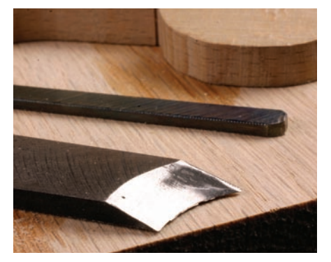
No small taper. Here you can see the bevel and the tang of two unfinished irons for snipes bills planes. The irons start thicker at the bevel and taper <sup>1</sup>/<sub>16</sub>" along their length. That's a lot of metal work.