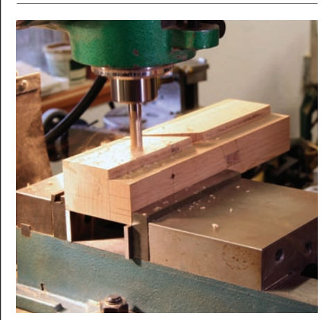
Machines help the hands. Here the Grizzly wood mill is milling out the hole for a depth stop on a moving fillister plane. While machines handle some of the operations, about 80 percent of the work is by hand.

This room would look like home to any furniture maker. There's a vintage Powermatic 66 table saw, a large Grizzly band saw, an older Makita floor model planer, a sander,