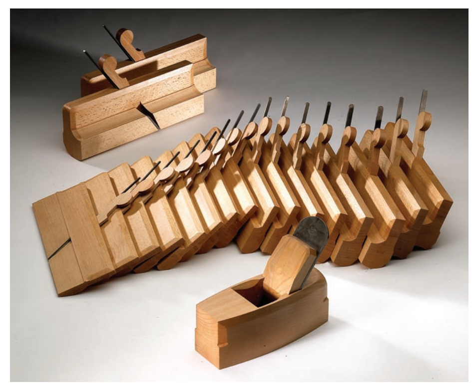
On making planes. "It's fun seeing them come to life, setting them up and sharpening them."