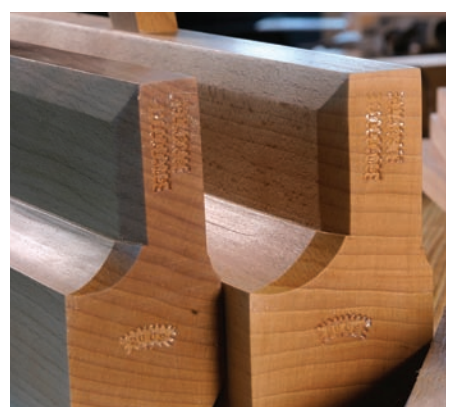
A steady hand. The swooping gouge cuts on the shoulders of the moulding planes require sharp tools and skill.