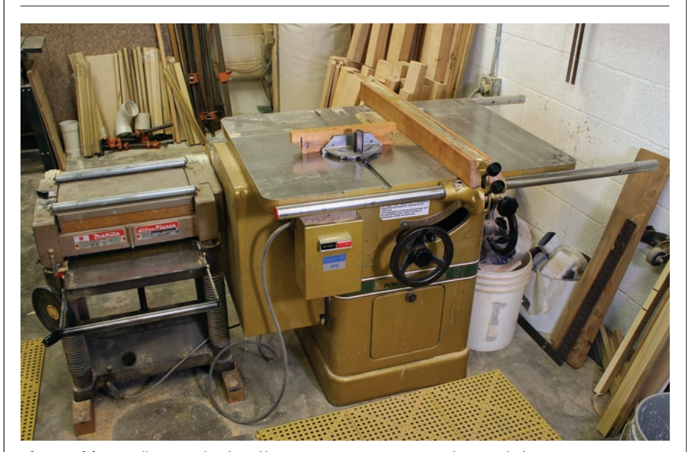
The woodshop. Williams is a big fan of his vintage Powermatic 66 and its simple fence. He never switched to the popular Biesemeyer system.

After that it's back and forth to the stations around the shop to prepare the planes for finish. Some operations, such as cutting them to final length and planing the tops, don't happen until the end so that the work is as crisp as possible.