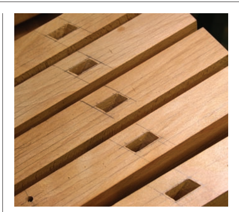
Mortises for wedges. "We've been careful not to design our tools around our machines."